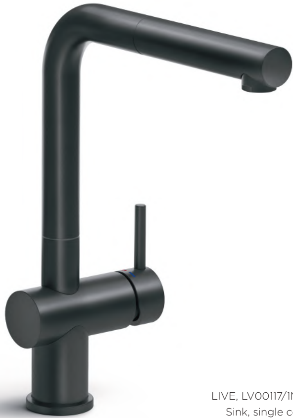
LIVE, LV00117/1NBMM Sink, single control