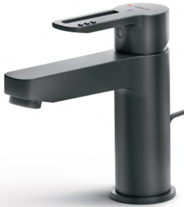
NEW ROAD, RDE0118/1NBMM Washbasin, energy saving single control